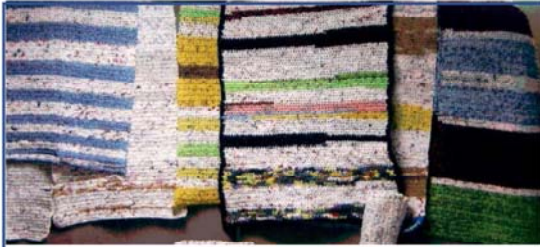
Sleeping mats made out of plastic grocery bags!

Finally! A helpful and beautiful solution for all those plastic bags! Is your home overrun by those plastic bags you bring home from shopping trips? Are you frustrated that they can't be recycled? Put them to good use! A local woman turns them into a portable sleeping surface for those in need. It takes 750-1000 bags to crochet them into one 6' x 4" mat. The mat helps to keep people warm, dry and comfortable. Bring your unwanted clean bags to the Mission Cove , place them in the box marked "Plastic Grocery Bags," and we'll pass them on to the mat maker. If you would like to learn how to create these mats yourself , please contact Nancy Prieskorn .